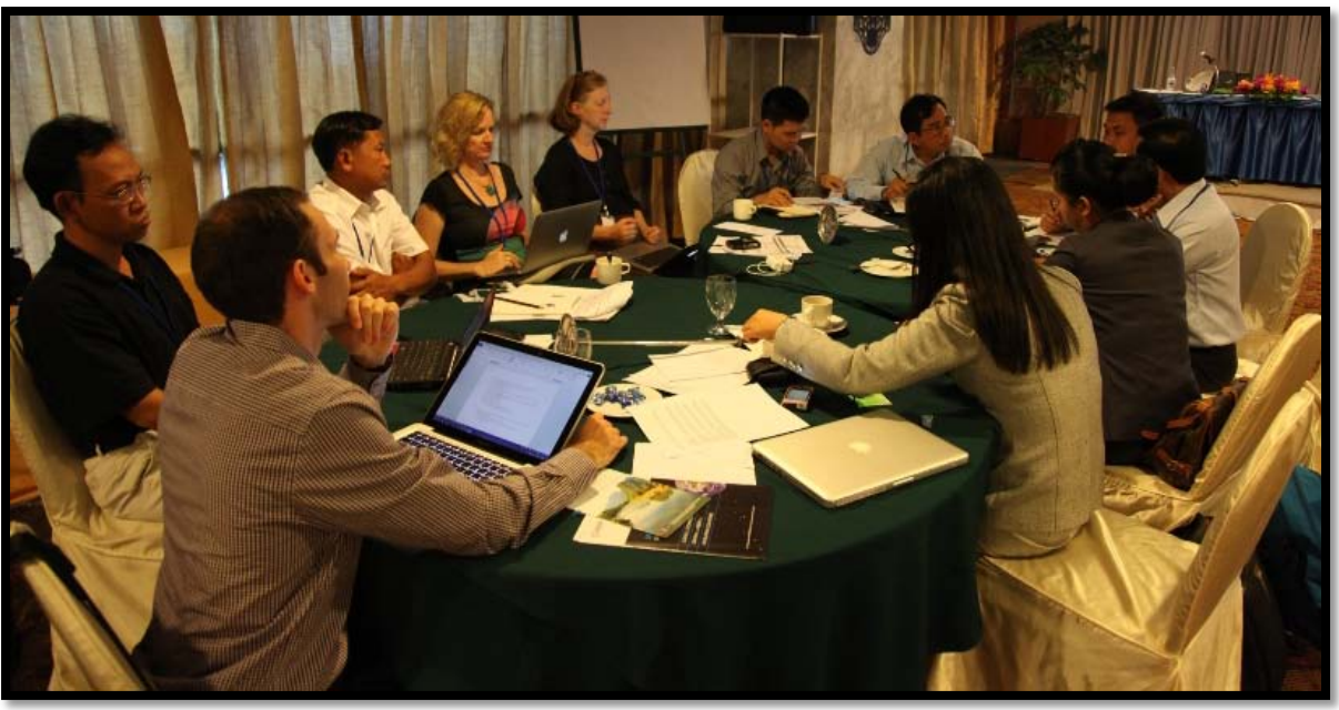
Figure 2. Participants at the BRIDGE technical forum engaging in group discussions.

5) BRIDGE and scientific dialogue: What role should the BRIDGE project play in coordinating data sharing and scientific dialogue among various projects and initiatives? Give examples and suggestions.