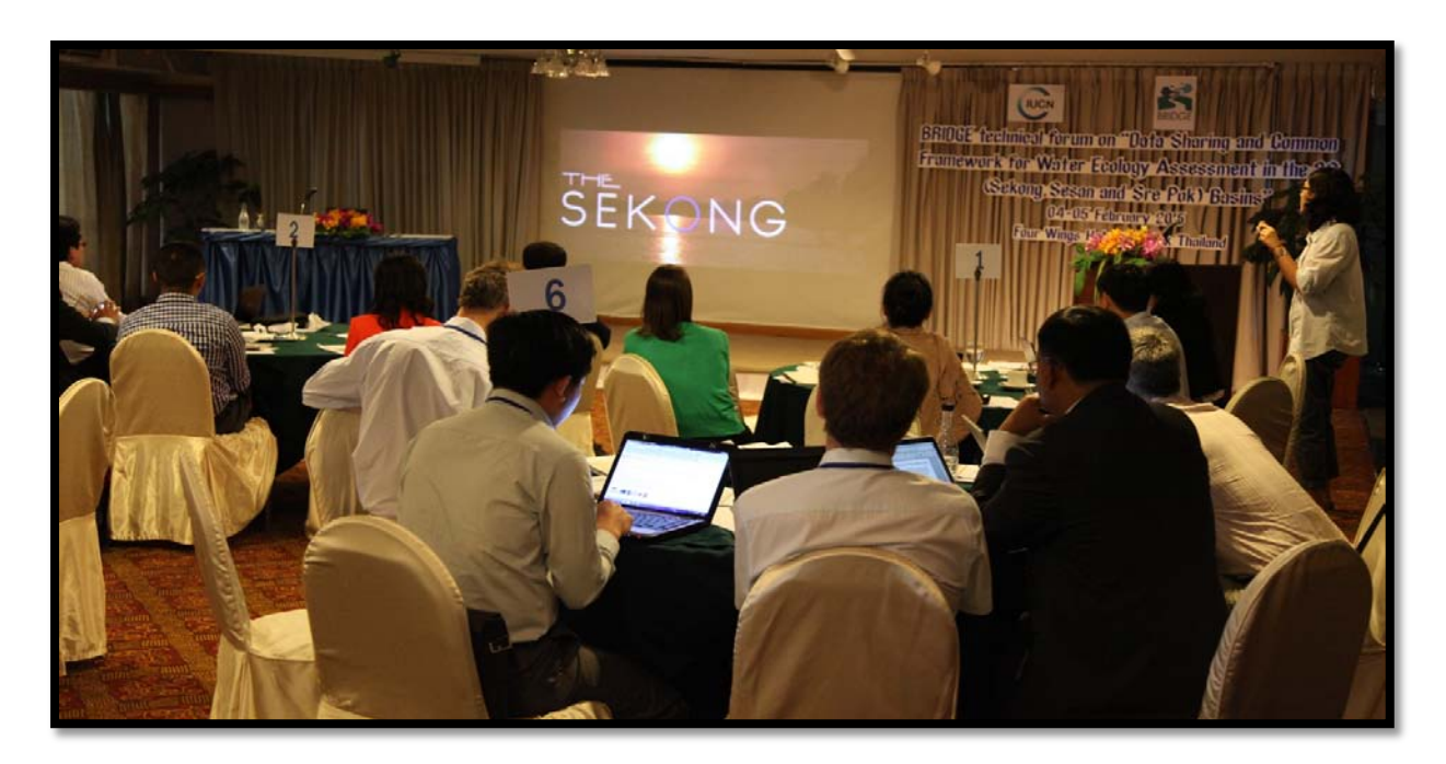
Figure 1. Screening of the Sekong movie at the BRIDGE technical forum.

Sekong Movie: Participants found the movie interesting and informative. More footage from stakeholders from Lao PDR would be beneficial. It was felt that this movie should also highlight ongoing cooperation among the 3S countries, their government departments and civil society organisations working in the Sekong River Basin and how it is contributing to the sustainable development of the 3S Basins in general. IUCN should incorporate feedback from policy makers on how to solve problems concerning the Sekong River Basin into the movie.